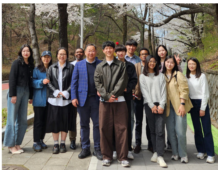
Animal Molecular Genetics Team, Chungnam National University

The study found that certain single nucleotide polymorphisms (SNPs) in the HNMT gene significantly impact the carnosine content in KNC-R chickens. Specifically, the synonymous SNP rs29009298C/T and the missense SNP rs736514667A/G were associated with higher carnosine content. These SNPs, along with sex differences (where females had higher carnosine content than males), highlight the genetic control over meat flavor quality.