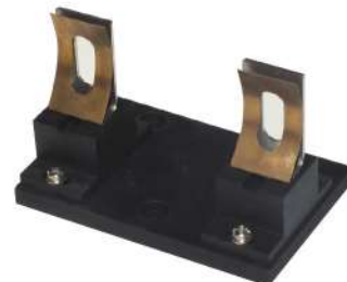
Single hole film holder