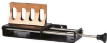
Manual 4-position film holder