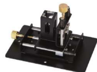
Adjustable micro cell holder