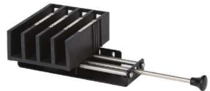
Manual 4-position 10cm cell holder