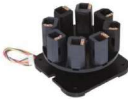
Automatic 8-position round cell holder