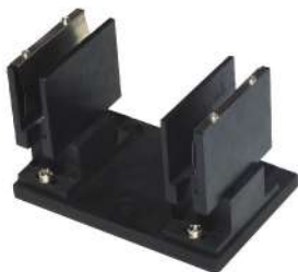
Single hole 5cm cell path holder