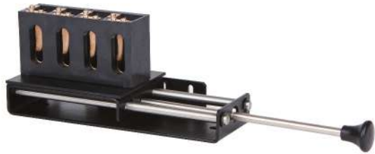
Manual 4-position cell holder (standard for single beam)