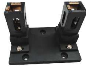
Single-hole cuvette holder (standard for double beam)